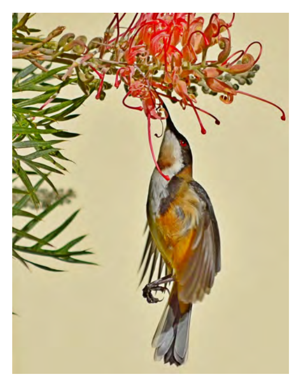
Eastern Spinebill taking nectar from a grevillea (Alan Lymbery)

The Eastern Spinebill is a flighty little bird that zooms around your garden or the bush looking for nectar from flowers.