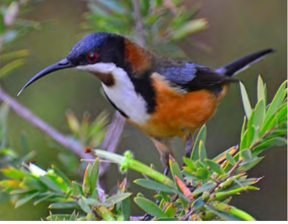
male Eastern Spinebill (Alan Lymbery)

Its long thin downward curved bill readily identifies it.