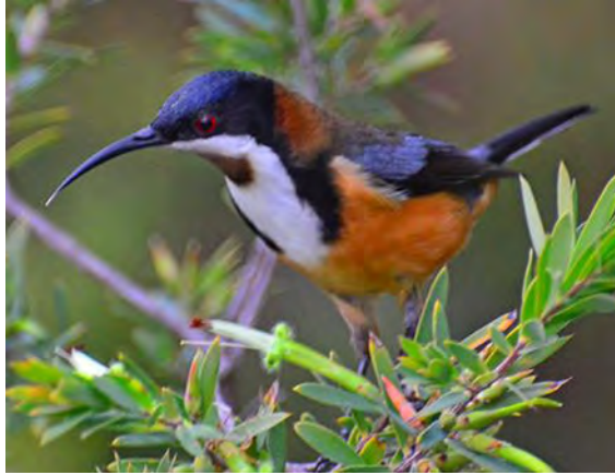
male Eastern Spinebill (Alan Lymbery)

Its long thin downward curved bill readily identifies it.