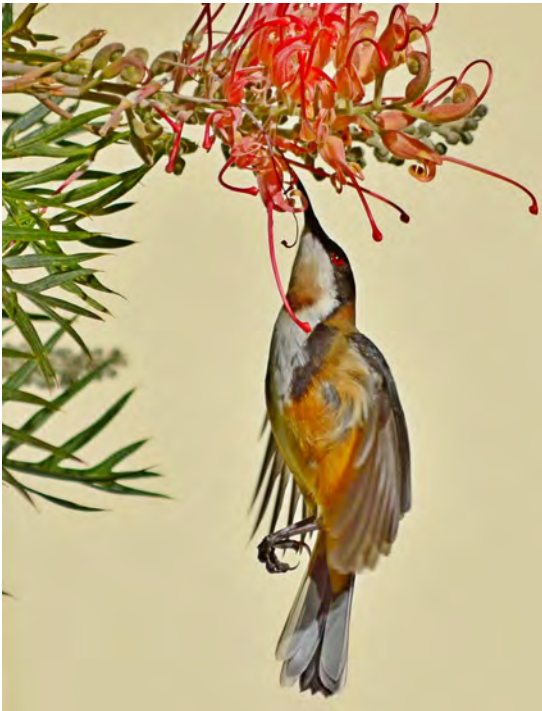
Eastern Spinebill taking nectar from a grevillea (Alan Lymbery)

The Eastern Spinebill is a flighty little bird that zooms around your garden or the bush looking for nectar from flowers.