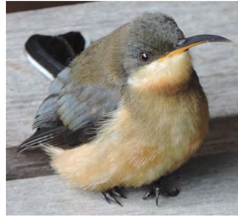
juvenile Eastern Spinebill (Dianne Page)

The Eastern Spinebill may migrate in winter from colder mountain regions to the coast.